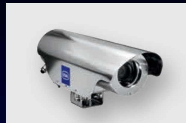
Full HD AFZ camera

YOUR ONE-STOP SUPPLIER FOR EX CCTV SYSTEMS An effective surveillance system needs more than just cameras. Only complete solutions which are perfectly matched to individual requirements can guarantee reliable real-time surveillance and a maximum of security.