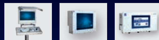
Operator station SHARK