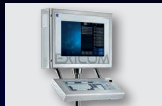
Operator station MANTA

The major part of R. STAHL human-machine interfaces and HMI solutions are certified for use in hazardous areas Zone 1, 2, 21, 22, Class 1, Division 2 / Class II, Division 1, 2 / Class III – they are suitable for use in harsh environments, aboard ships, and in GMP and cleanroom environments.