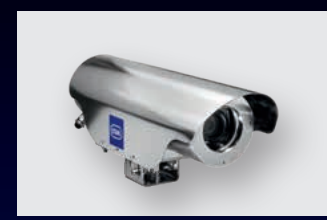
Full HD AFZ camera